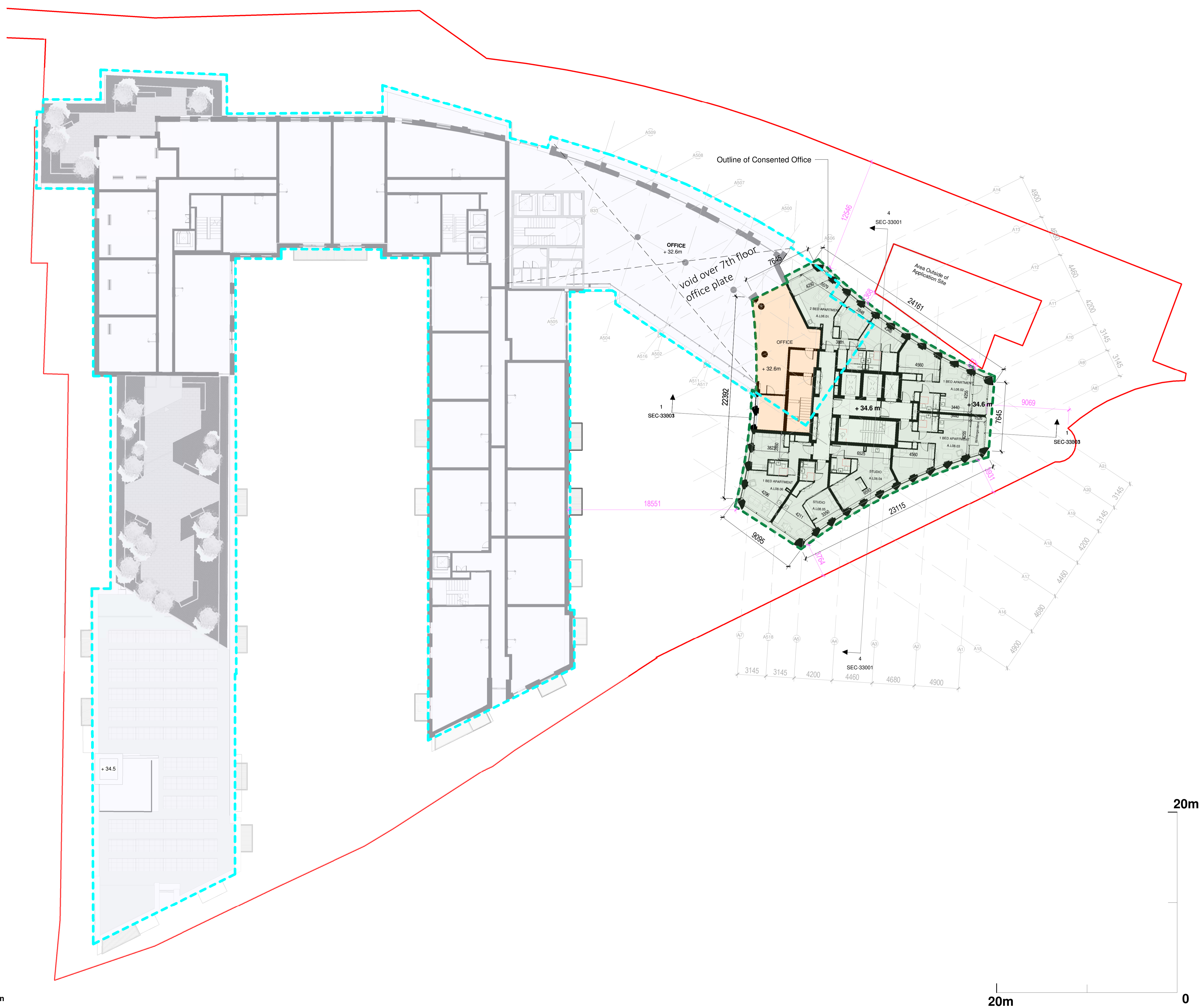
Proposed 8th Floor Plan 1 : 200